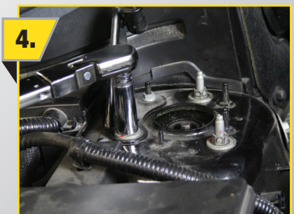
Torque in alternating pattern